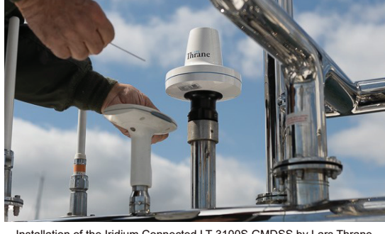
Installation of the Iridium Connected LT-3100S GMDSS by Lars Thran

Iridium GMDSS allows ships to quickly send definitive location and identification information to a Rescue Coordination Centers (RCC) and speak to an RCC operator to share key distress information, within 30 seconds of pressing the red distress button. Additionally, Iridium GMDSS includes Iridium SafetyCast<sup>™</sup>, which delivers important navigational and meteorological information to vessels with Iridium onboard, enabling proactive safety measures. Iridium's global GMDSS services could have a significant effect on the success of a Search and Rescue operation.