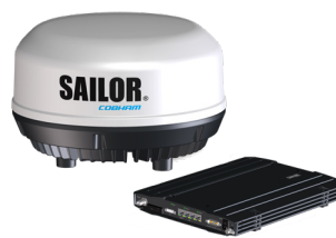
Cobham SAILOR 4300 Maritime