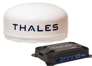
Thales VesseLINK™ Maritime