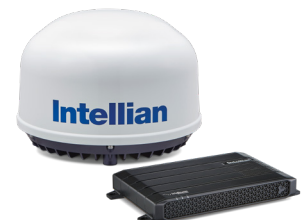
Intellian C700 Maritime