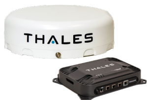
Thales MissionLINK™ Land Mobile