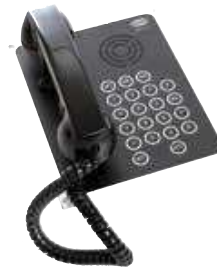
5113 / 5123 / 6113 / 6123 Telephone