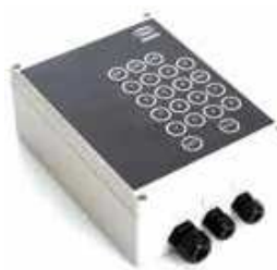
6112 W.P. unit without handset