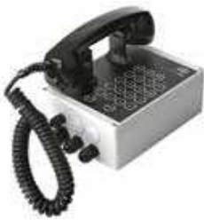
6111 W.P. unit w/handset