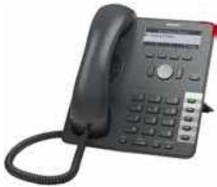
Snom 710 IP telephone