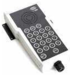
6124 W.P. unit