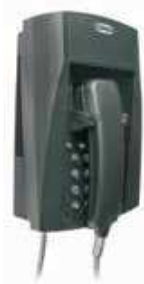
5111 Watertight telephone