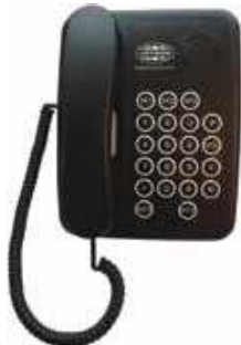
6110 MkII Indoor unit