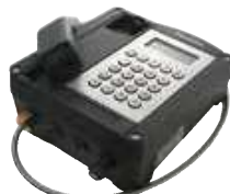
RESISTEL EX Telephone Fernsig