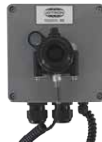
Microphone station 1808 dual system