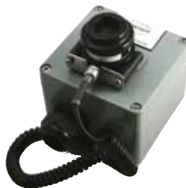
Microphone station 1176 single system