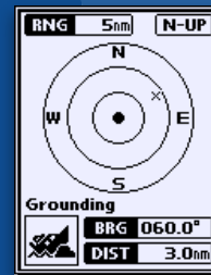
Pop-up window for position check