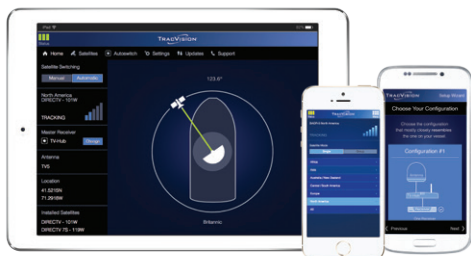
TV-Hub user interface provides system control from any mobile device or computer.