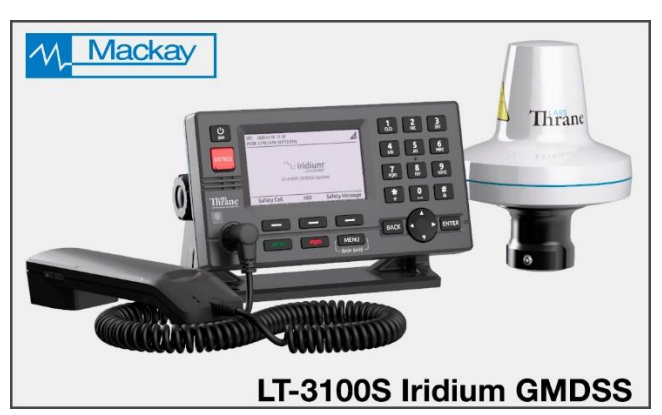
Fully meets IMO GMDSS regulations as pictured. Add-on interface module for ISPS SSAS, LRIT services available now

About Mackay | Mackay Communications, Inc. (dba Mackay Marine) sells, installs, and services communication and navigation equipment onboard vessels of all class and size. Mackay, in business for over 135 years, has 3,500+ customers spread over every continent, annually conducts 18,000+ service calls, employs 340 seasoned professionals, with locations in more than 50 major ports. Mackay World Service coordinates service, installation, and inspections 24/7 for all ports, worldwide. For more details visit: <a href="https://www.mackaymarine.com">https://www.mackaymarine.com</a>