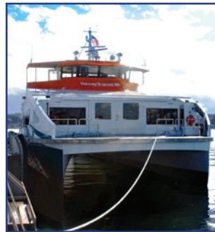
Nichols Brothers Boat Builders: Kitsap MV ENTAI Fast Ferry