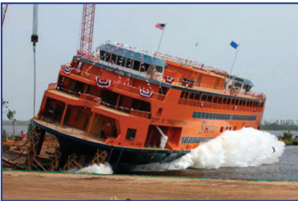
Eastern Shipbuilding Group – Staten Island Ferry