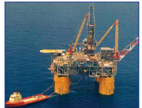
Shell Mars B