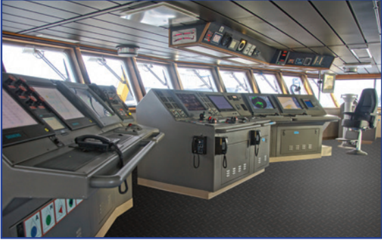
AGOR - Sally Ride (Bridge & Vessel) Naval Research