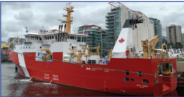
Seaspans Shipyards Offshore Fisheries Science Vessel (OFSV), CCGS John Cabot.