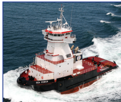
SEACOR Sea Power