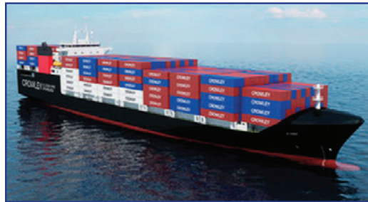
Crowley Maritime: El Coquí ConRo Vessel... 2019 Workboat of the Year