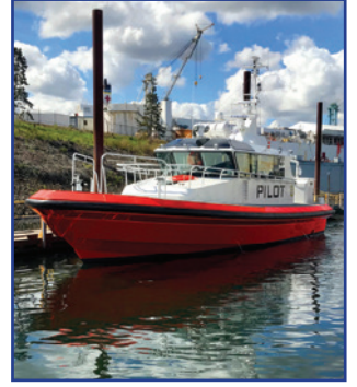
Vigor, LA Pilot Boat