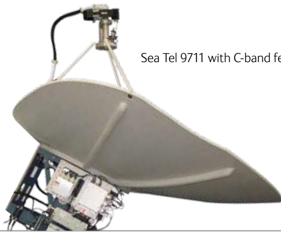
Sea Tel 9711 with C-band feed.