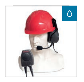
CHPHS/DT9* Single sided ear defender headset for hard hat use