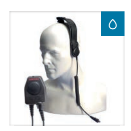
CXR5/DT9* Bone conductive skull mic with heavy duty PTT